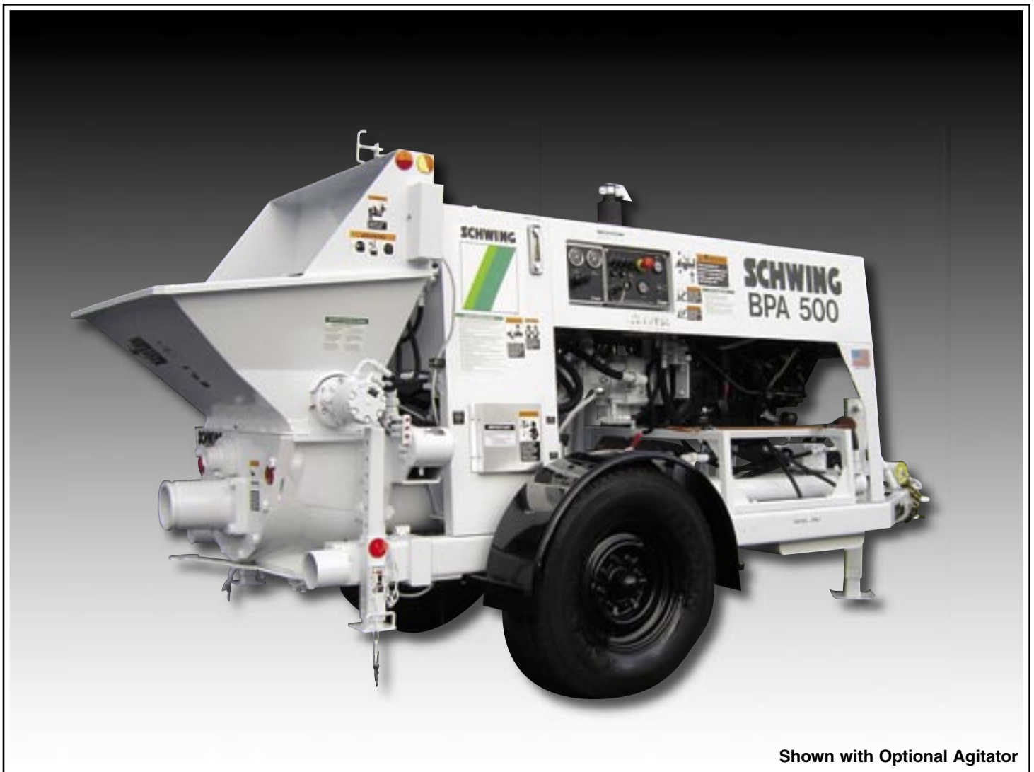
Shown with Optional Agitator